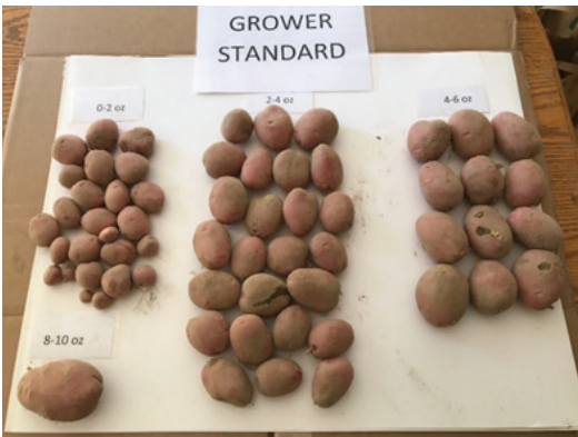
Above: Potatoes from the Grower's Standard fertilizer program. Groups of potatoes by weight, clockwise from upper left, 0-2 oz., 2-4 oz., 4-6 oz., 8-10 oz.