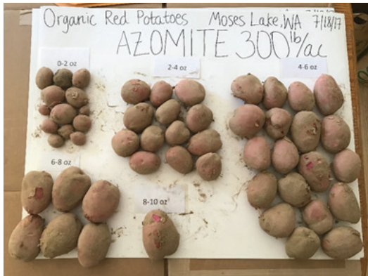
Above: Potatoes with AZOMITE at 300 lbs/ac. Groups of potatoes by weight, clockwise from upper left, 0-2 oz., 2-4 oz., 4-6 oz., 8-10 oz., and 6-8 oz.